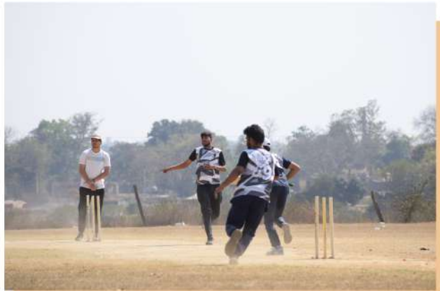
Anupam Tirkey memorial trophy