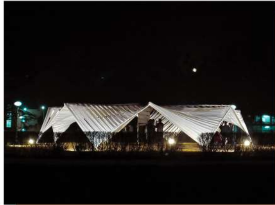
Bitotsav Pavillion by Architecture students