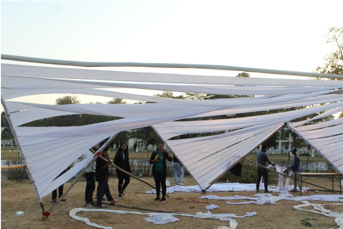
Pavilion construction in process.