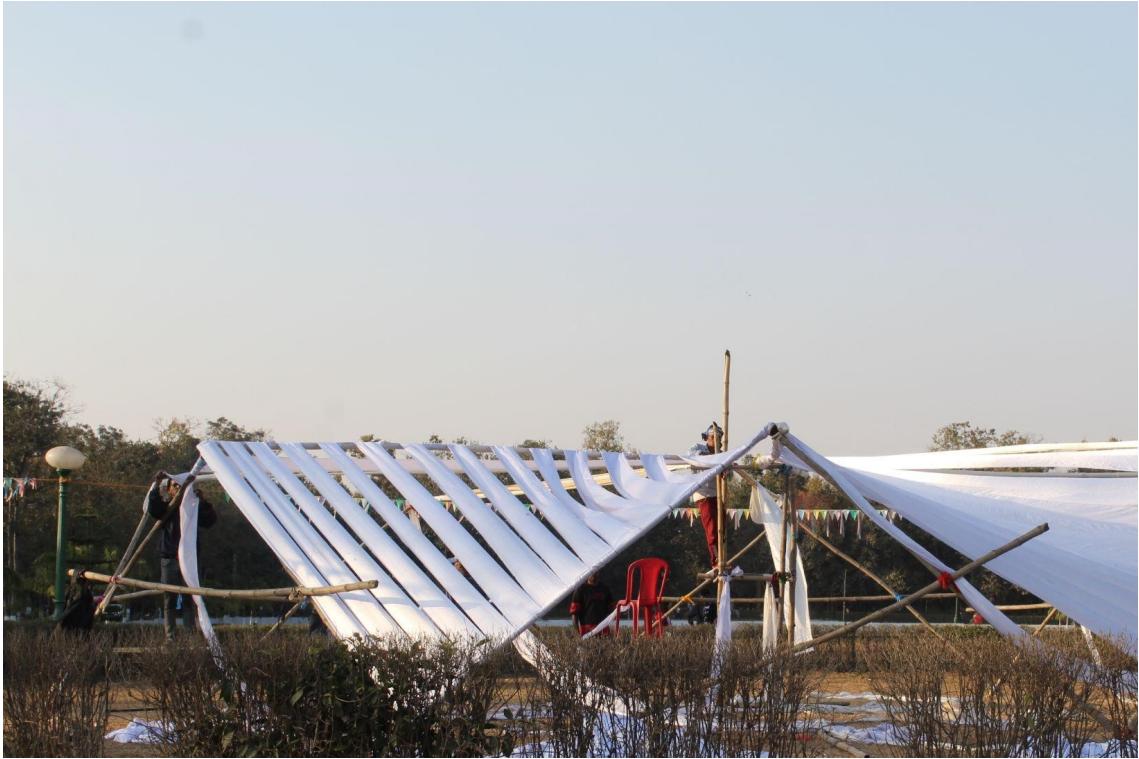
Pavilion nearing completion.