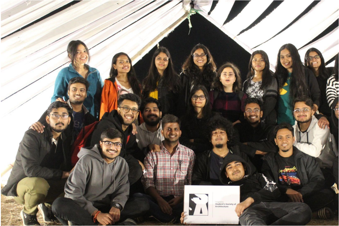
SSA (2023) members pose for a group photograph.